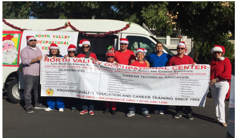
NVOC Student Council walk the Granada Hills Holiday Parade.