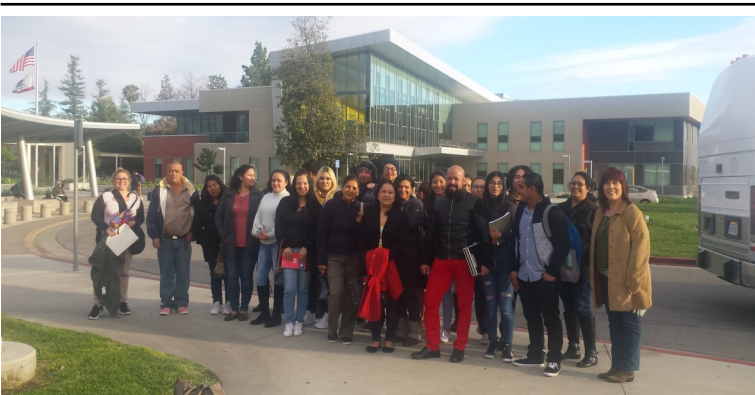
NVOC Students Visit LA Valley Community College in April.