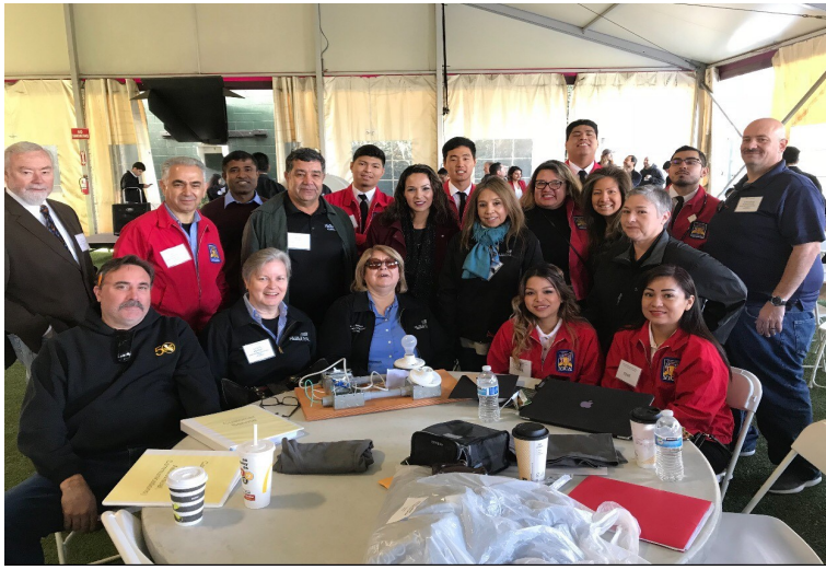
NVOC Takes Gold in the SkillsUSA Regional Competition