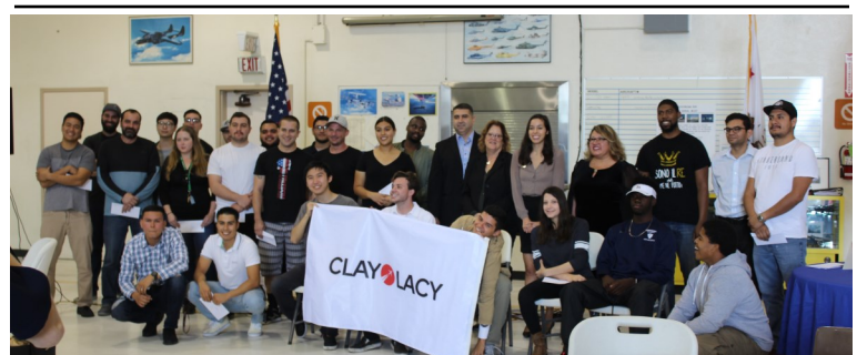
NVOC Aviation Celebrates Veterans Day and Student Scholarships