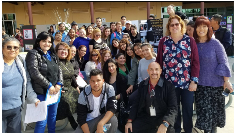
EVSC Celebrates Woman's Day in April.