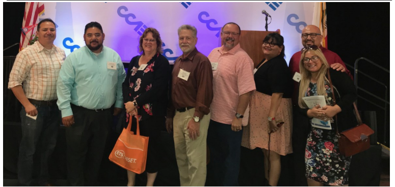
NVOC Staff assembles at the CCAE Spring Conference in Fresno.