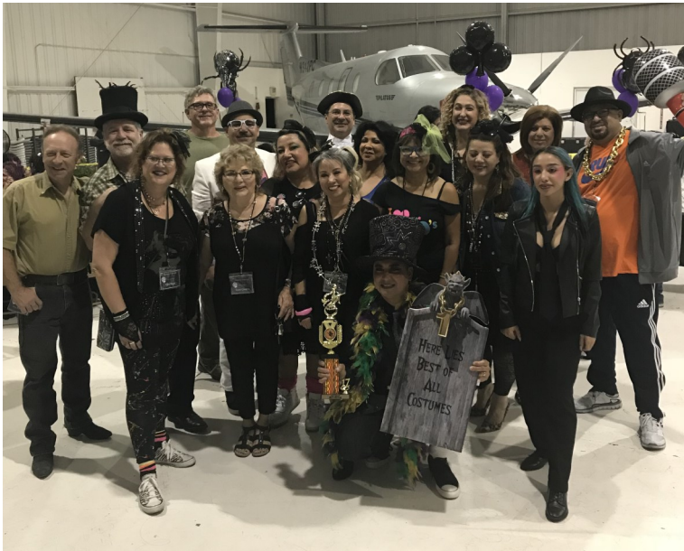
NVOC Staff goes 80's for Thrills For Skills to raise money for SkillsUSA in October.