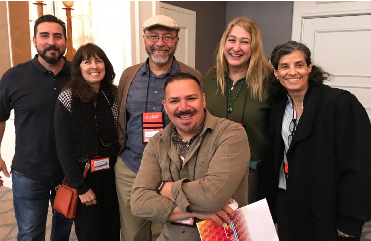
NVOC Staff attends the LARAEC Conference in March.