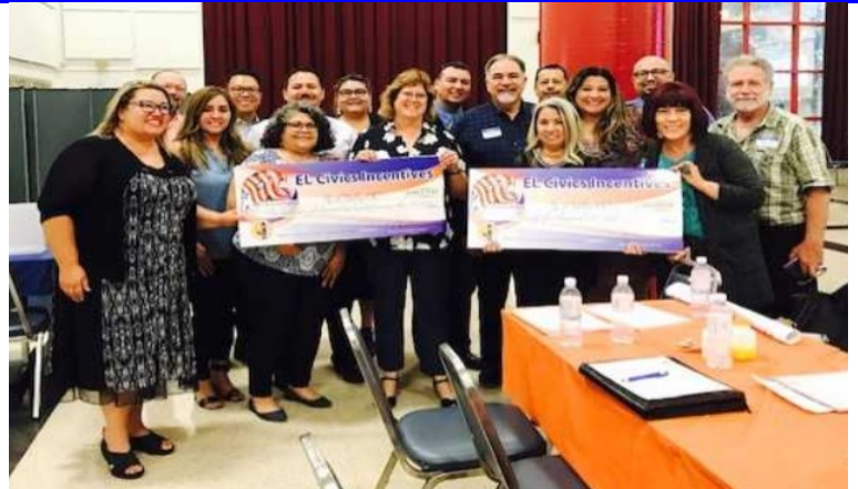
NVOC receives El Civics Incentive grants over 100K in September.