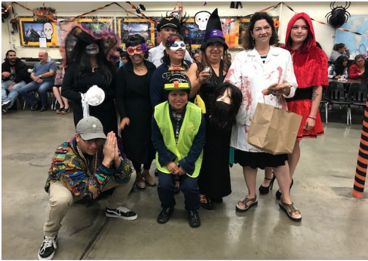
NVOC Student Council stage a Costume Contest in October.