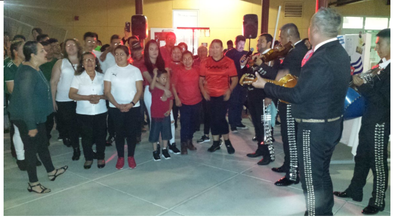
EVSC sings along with a Mariachi during Multi-national Day in April.