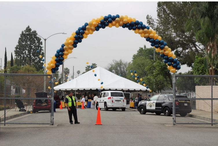
April is NVOC's Job Fair/Open House.