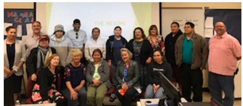
Writing Workshops Offered by LACOE.