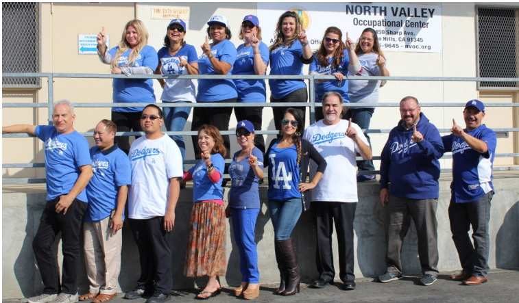
NVOC Staff Dons Dodger Gear for the World Series. 2017. Unfortunately, Dodgers lose to Huston's Astros in October